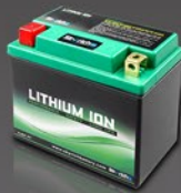
4Ah Lithium battery