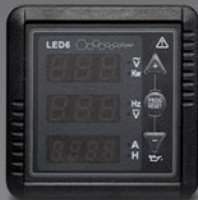
LED6 Voltage AC Power output Frequency Battery voltage Current Working time