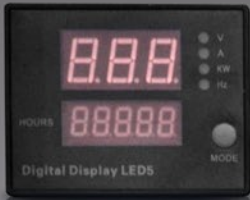
LED5 Voltage AC Power output Frequency Current Working time