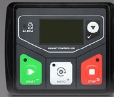
D30 (ATS) Smart controller