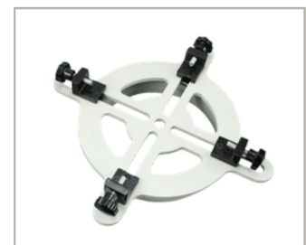
Stub End Chuck