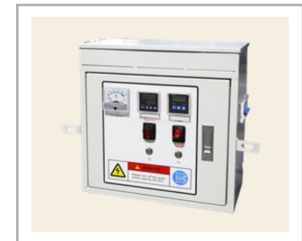
Electrical Connection Box